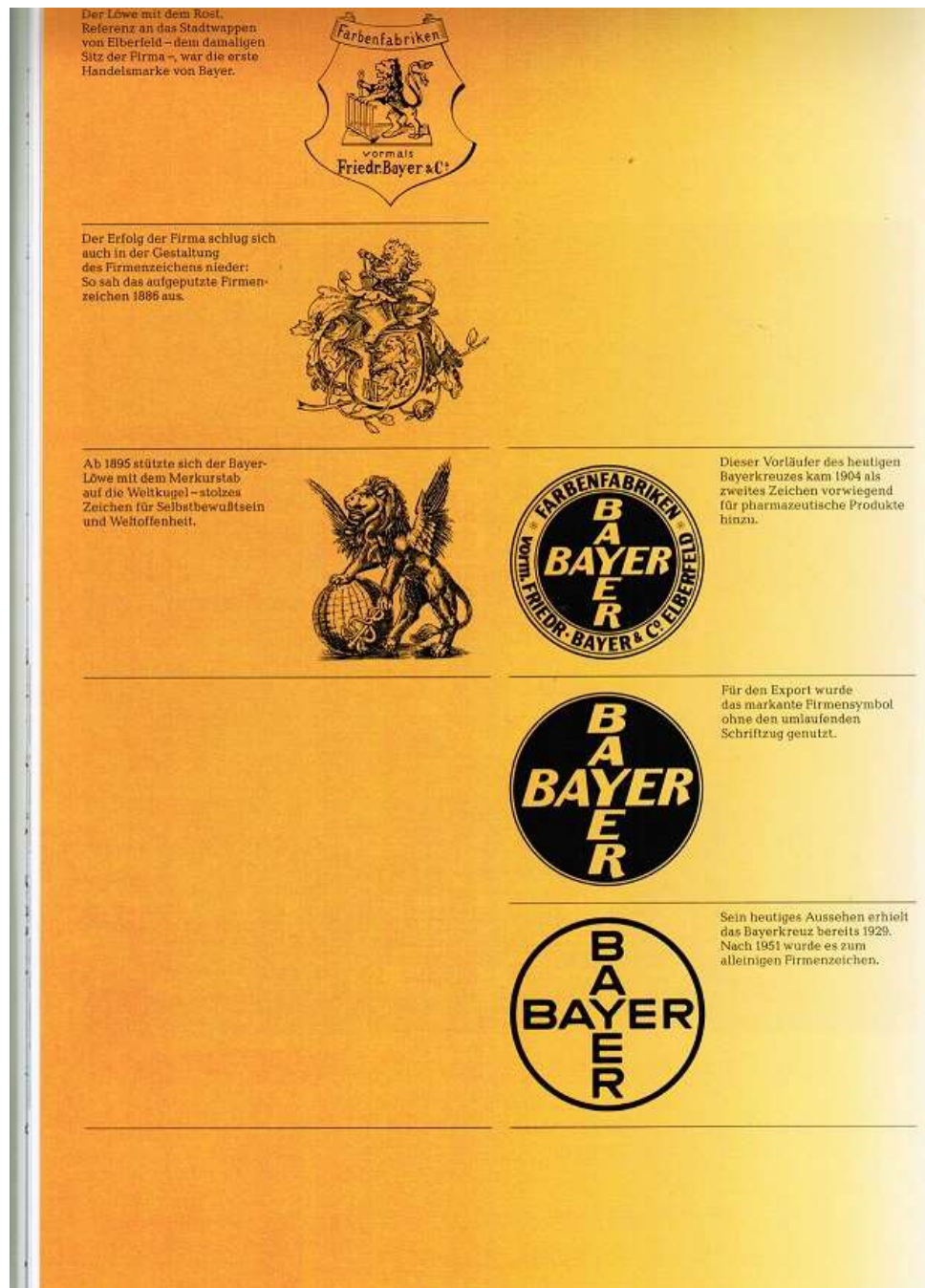
Entwicklung des Bayer-Logos Ende des 19. bis Mitte des 20. Jh.