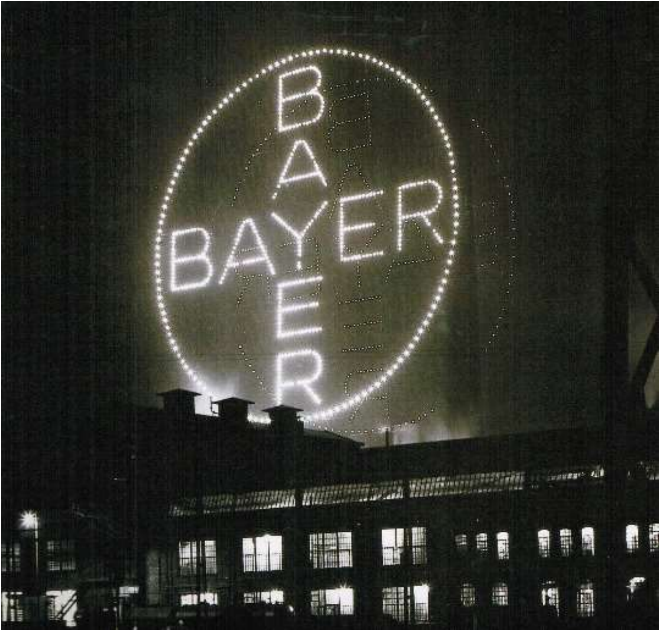
Lichtwerbung Bayer-Kreuz in Leverkusen