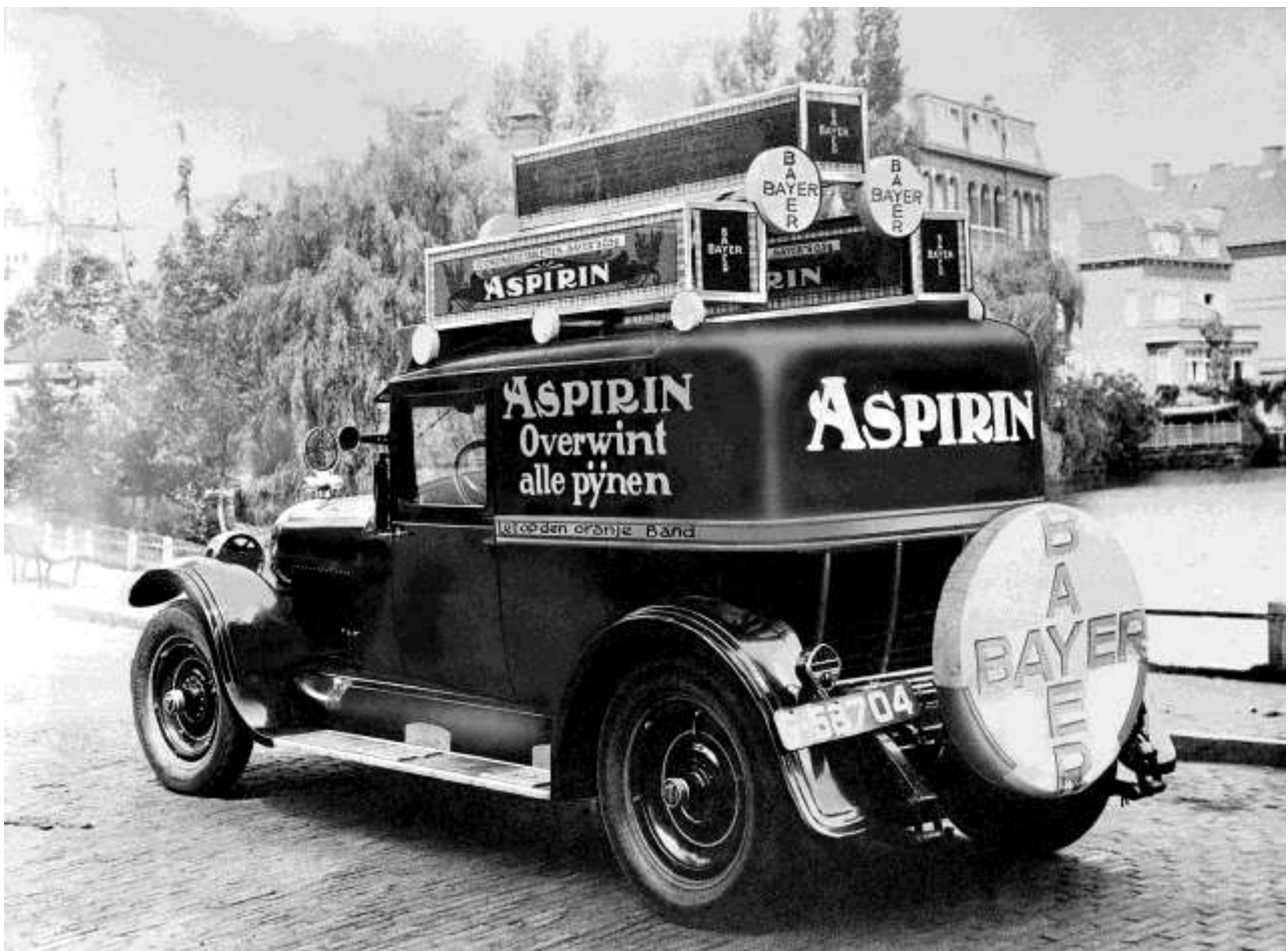
Bayer AG Corporate History & Archives