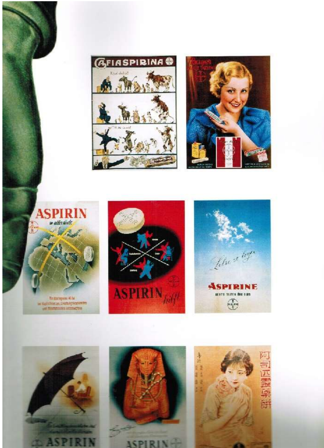
Internationale Werbeplakate der 1920er/30er Jahre, Bayer AG Corporate History & Archives